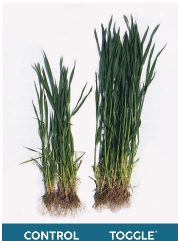
Toggle®-treated wheat is better developed and fuller.

MITIGATES ENVIRONMENTAL STRESSES Give every kernel the ability to better handle stress by incorporating Toggle®. With its numerous bioactive compounds such as mannitol, unique polysaccharides and betaines, Toggle® improves plants' tolerance to a variety of stressful growing conditions including drought, heat, chill and salinity stress.