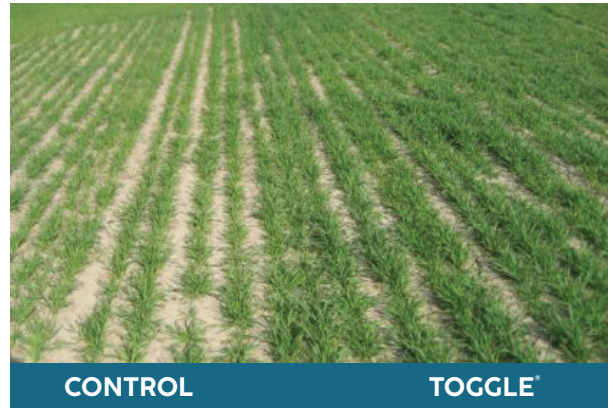
Adding Toggle® at tillering enhances the numbers of tillers as well as encourages strong early growth.

In addition, Toggle® contains complexing sugars that bind to micronutrients, improving their translocation and bioavailability within the plant.