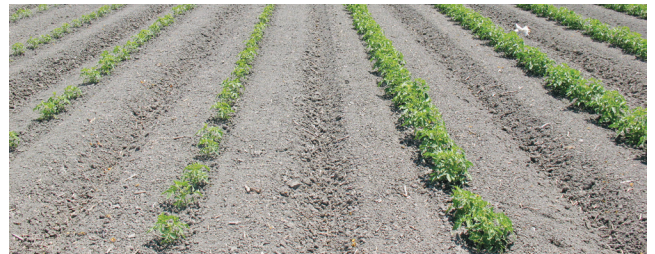
CONTROL STELLA MARIS®

INCREASES NUTRIENT UPTAKE Good nutrition is key to quality tomato and pepper production. Stella Maris® helps your crop take up more key nutrients such as nitrogen and calcium. Plants with healthier root systems can absorb more water and nutrients from the soil, resulting in a stronger, more productive crop. In addition, Stella Maris® contains natural complexing sugars, which bind to micronutrients, thereby improving the bioavailability and translocation of nutrients within the plant.