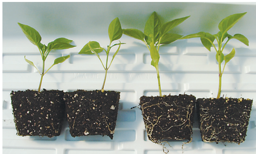
CONTROL STELLA MARIS®